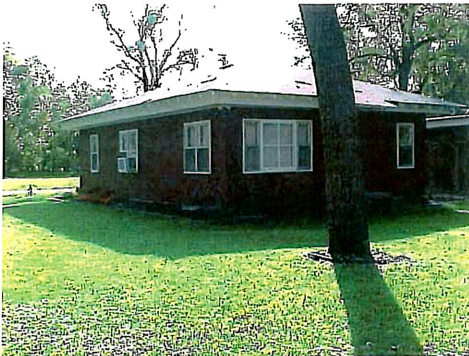
House from northwest